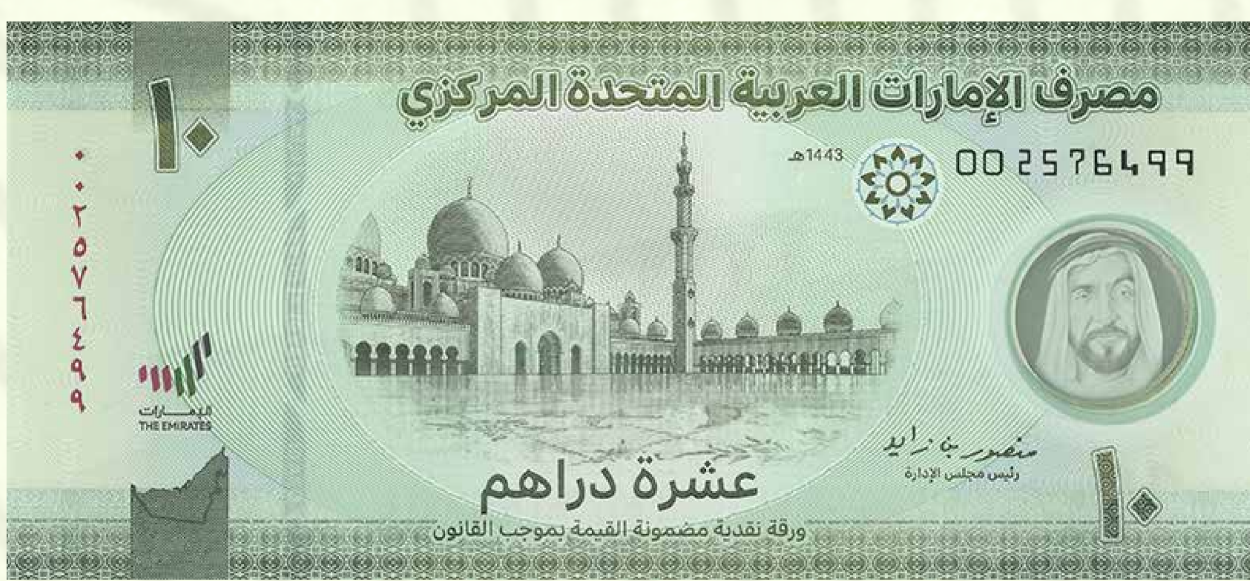
Front 10 DIRHAMS Dimensions: 147 x 66mm.

The note features a circular transparent window featuring an image of Sheikh Zayed bin Sultan Al Nahyan. The window is surrounded by iridescent ink. The windowed security strip on the back is printed and contains the text '5 AED' in Arabic and Latin. The note includes an embossed dot for the benefit of the visually impaired.