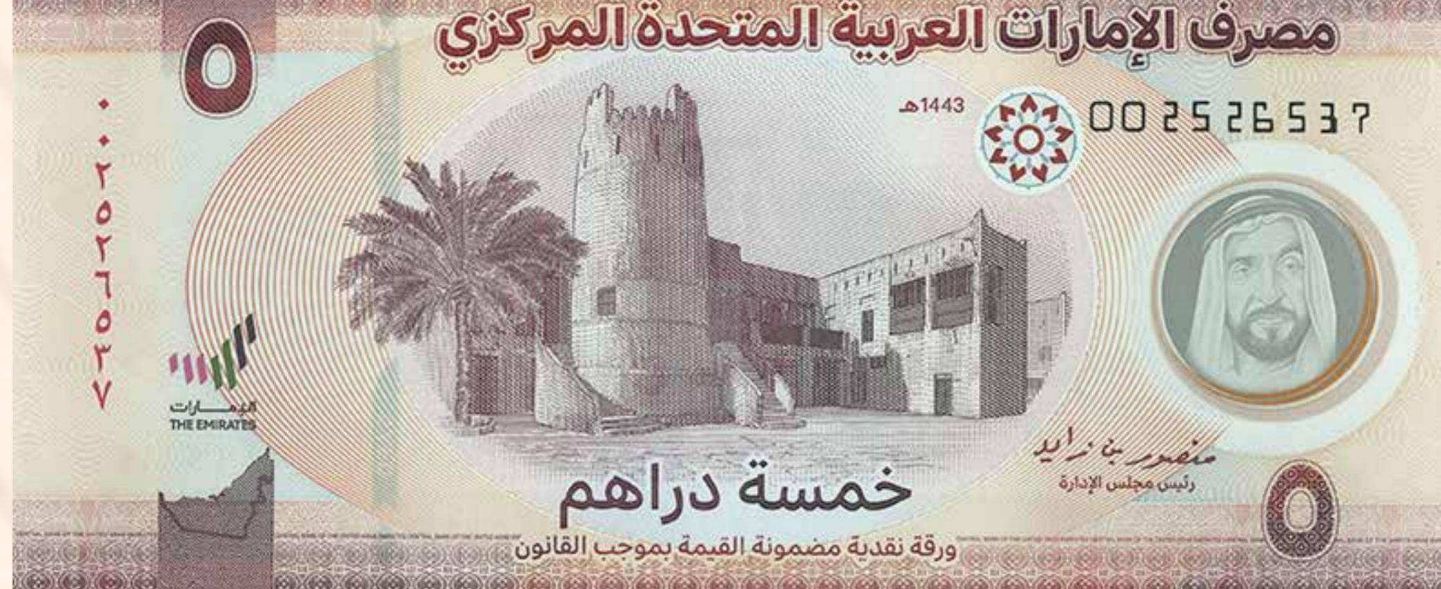
Front 5 DIRHAMS Dimensions: 143 x 66mm.

The new notes were issued in April 2022 and are the third version of the 5- and 10-Dirham banknotes. It is notable that the new banknotes are printed on a polymer substrate, not on cotton as the previous notes were. The two new notes have the same colour scheme as the 5- and 10-Dirham notes already in circulation, so that the public does not confuse it with another denomination. The symbols and images on the notes reflect the UAE's history and heritage. Both notes include a transparent window featuring a portrait of the late Founding Father, Sheikh Zayed bin Sultan Al Nahyan. Current banknotes of both denominations will remain in circulation along with the new polymer notes.