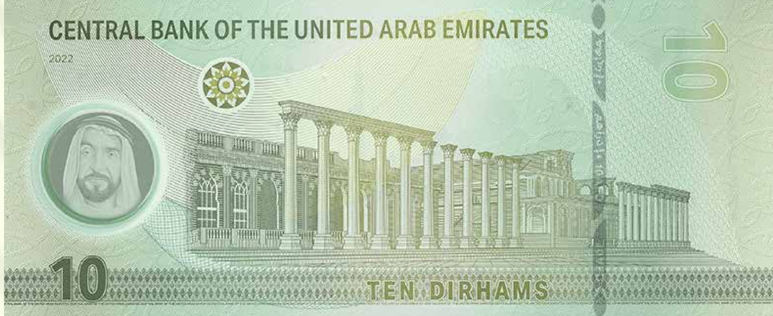
Back 10 DIRHAMS Dimensions: 147 x 66mm.