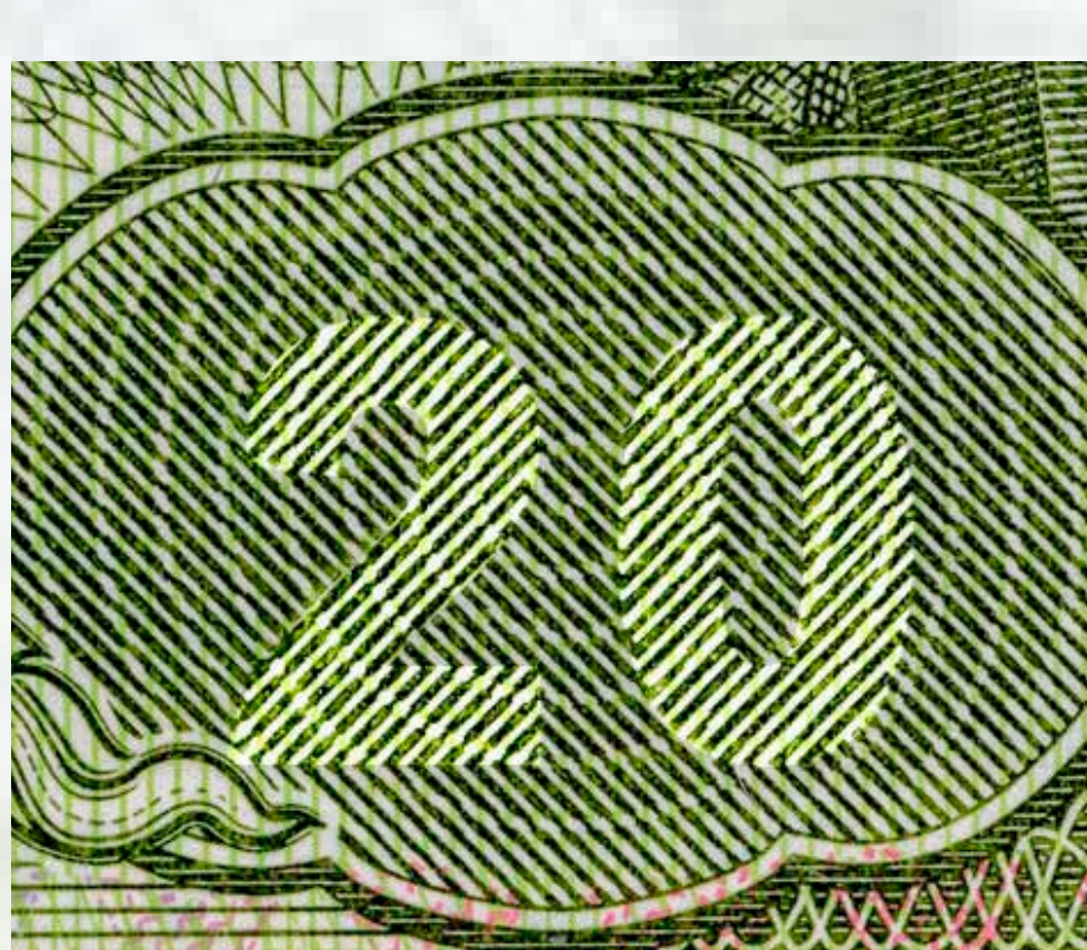
Anticopy latent image