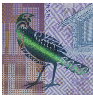
Optically Variable Device