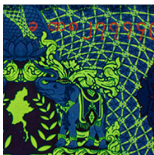
Security feature under UV light